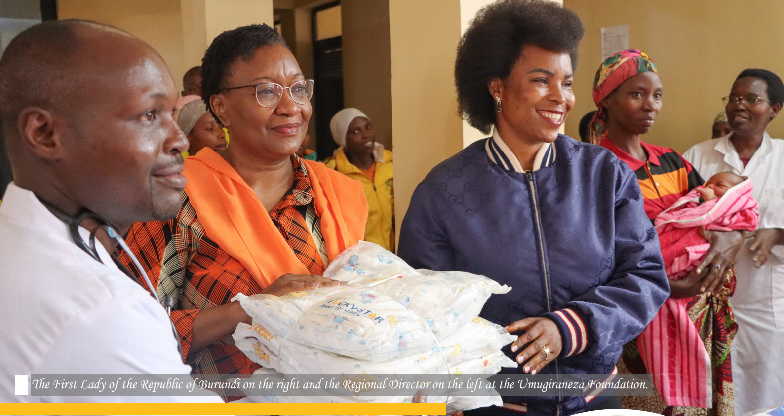
The First Lady of the Republic of Burundi on the right and the Regional Director on the left at the 'Umugiraneza Foundation.