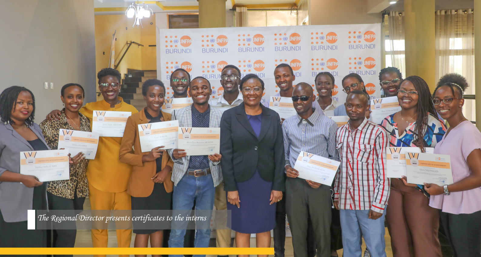
The Regional Director presents certificates to the interns