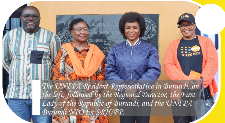
The UNFPA Resident Representative in Burundi, on the left, followed by the Regional Director, the First Lady of the Republic of Burundi, and the UNFPA Burundi NPO for SRH/FP.

The Regional Director was received in audience by the First Lady of the Republic of Burundi, Her Excellency Mrs. Angeline NDAYISHIMIYE. During their meeting, they discussed the challenges surrounding maternal health in Burundi, including the necessary actions to address these issues and improve the care for women living with obstetric fistulas. Their conversation also focused on the goal of achieving zero obstetric fistulas. Additionally, they addressed topics related to girls' education and nutrition.