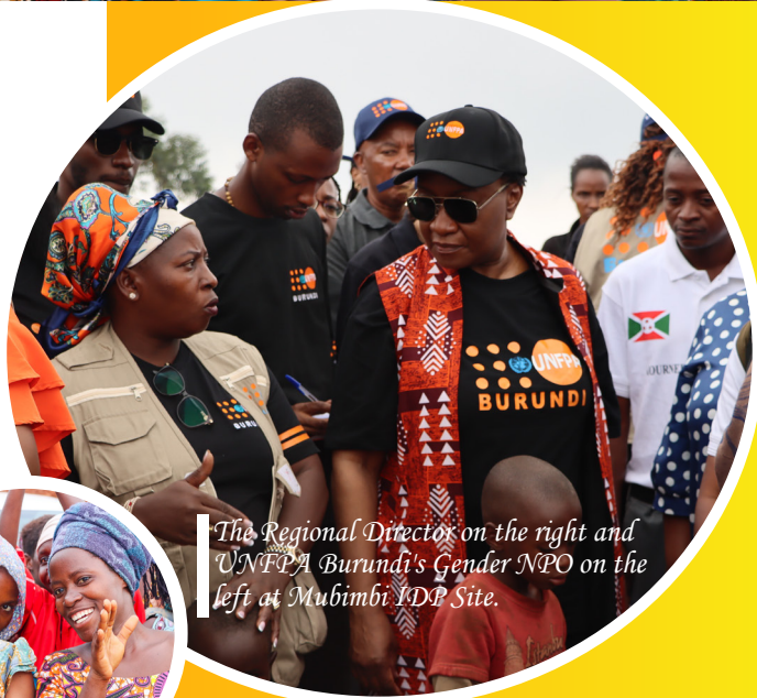
The Regional Director on the right and UNFPA Burundi's Gender NPO on the left at Mubimbi IDP Site.

At the Humura Center in Gitega, dedicated to the integrated care of GBV survivors, the Director inquired about the social, economic, legal, and medical services provided, reflecting a holistic approach essential for helping survivors rebuild their lives and regain their dignity. She witnessed the efforts made by the center and listened to the testimonies of several survivors who, by breaking the silence, advocate for advancing the cause of women and girls' rights.