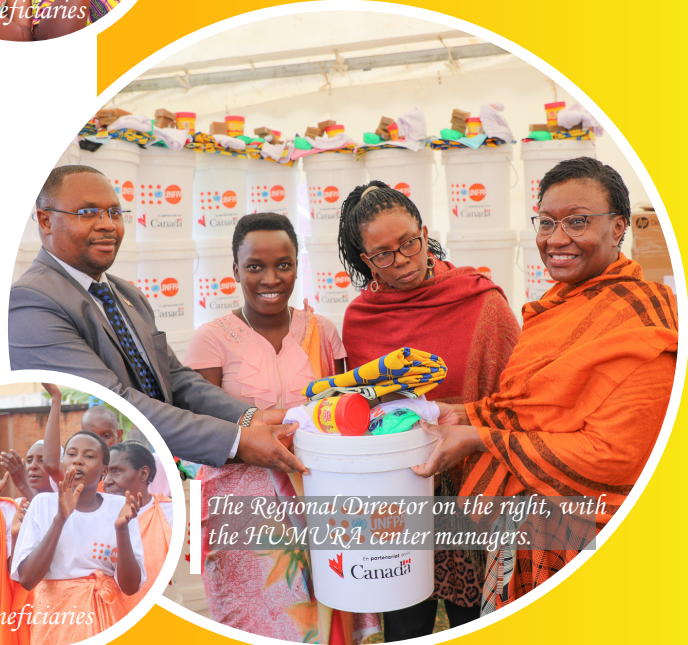
The Regional Director on the right, with the HUMURA center managers.