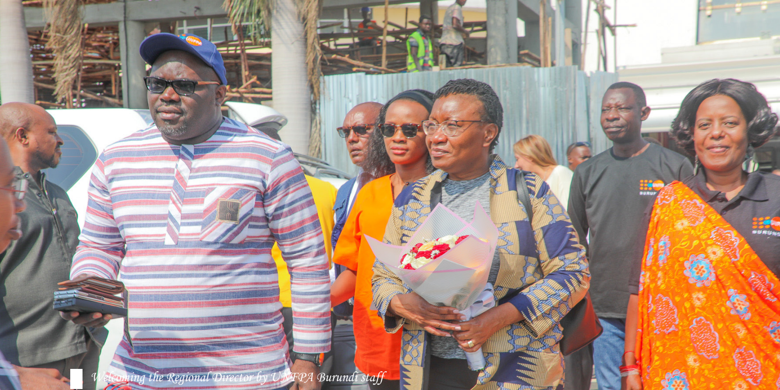
Welcoming the Regional Director by UNFPA Burundi staff