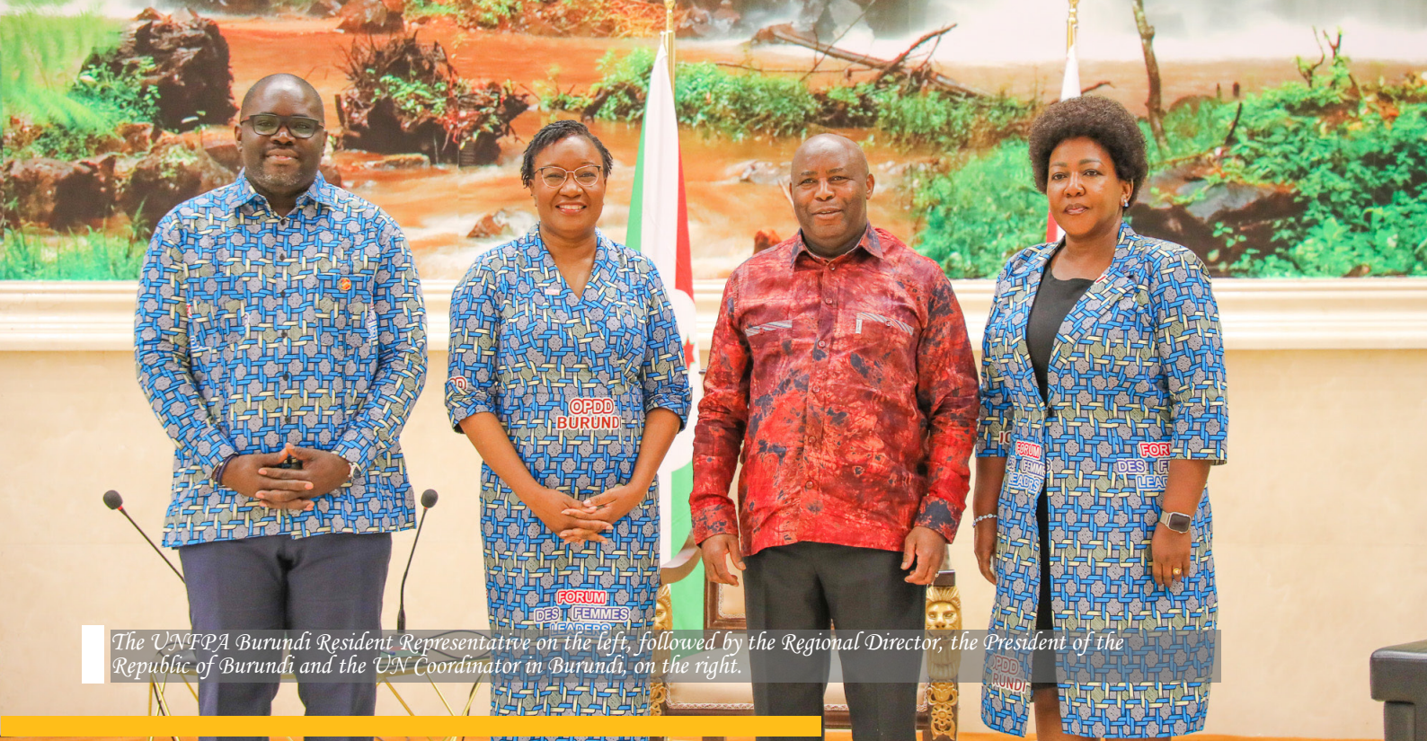
The UNFPA Burundi Resident Representative on the left, followed by the Regional Director, the President of the Republic of Burundi and the UN Coordinator in Burundi, on the right.