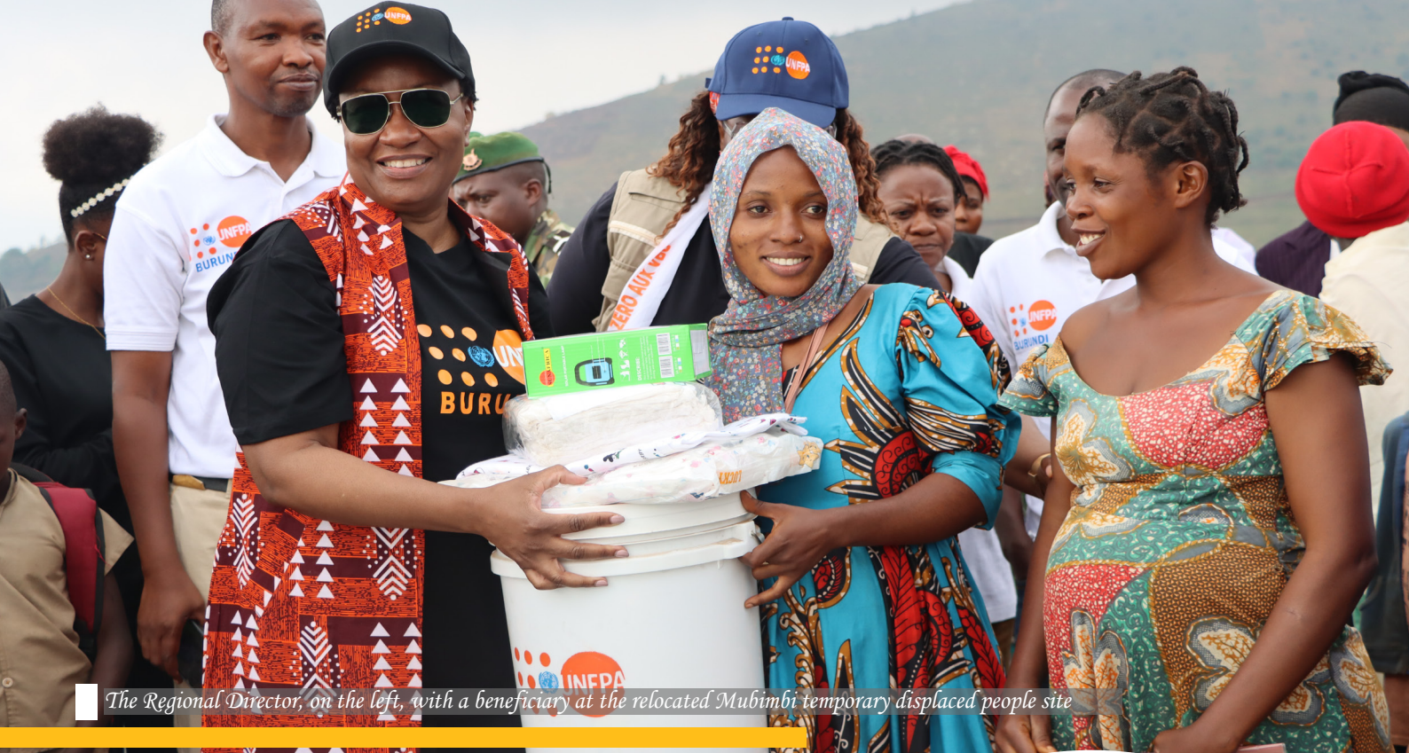
The Regional Director, on the left, with a beneficiary at the relocated Mubimbi temporary displaced people site