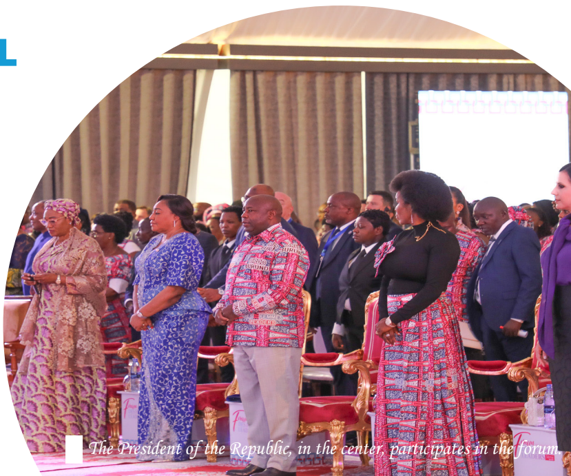
The President of the Republic, in the center, participates in the forum.

On October 7th and 8th, the 5th Edition of the High-Level Forum of Women Leaders was held in Burundi, under the high patronage of His Excellency President Général Major Evariste NDAYISHIMIYE, and chaired by Her Excellency First Lady Angeline NDAYISHIMIYE. Several foreign delegations, led by First Ladies, also participated in the event, including delegations from Nigeria, Serbia, Gabon, and the DRC. The event was attended by government officials, including the Prime Minister and Ministers, members of Parliament and the Senate, the accredited Diplomatic Corps in Burundi, and the United Nations System, including UNFPA.