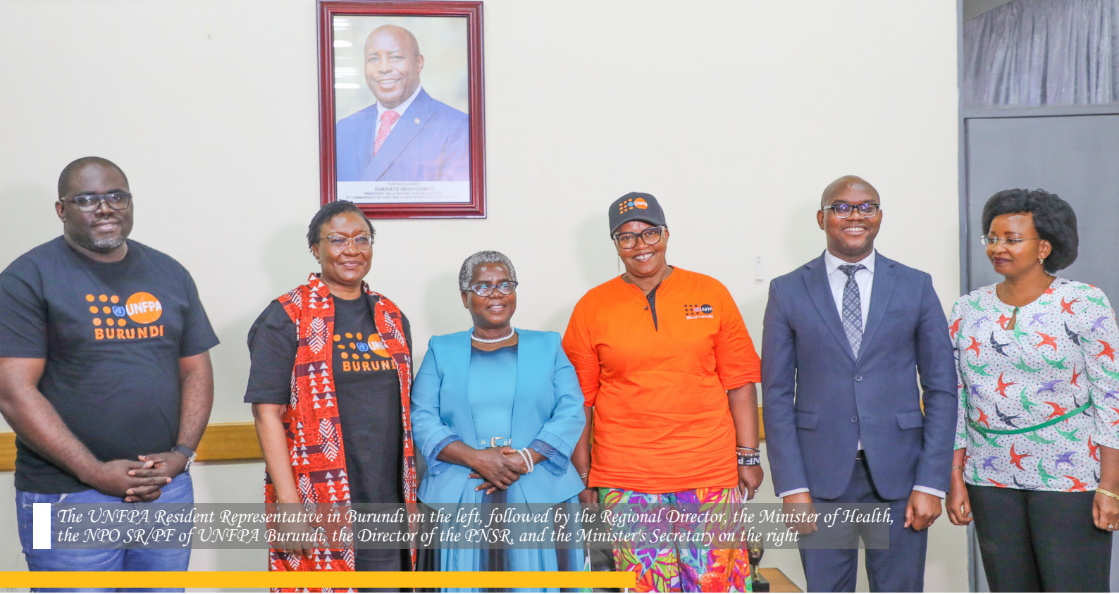
The UNFPA Resident Representative in Burundi on the left, followed by the Regional Director, the Minister of Health, the NPO SR/PF of UNFPA Burundi, the Director of the PNSR, and the Minister's Secretary on the right