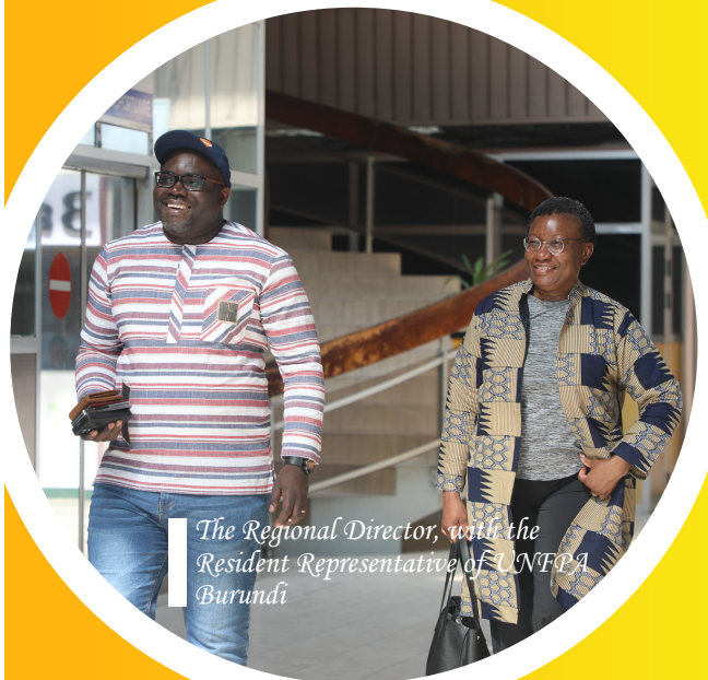
The Regional Director, with the Resident Representative of UNFPA Burundi