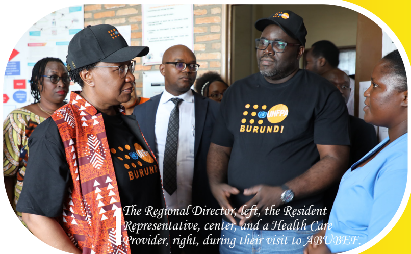
The Regional Director, left, the Resident Representative, center, and a Health Care Provider, right, during their visit to ABUBEF.