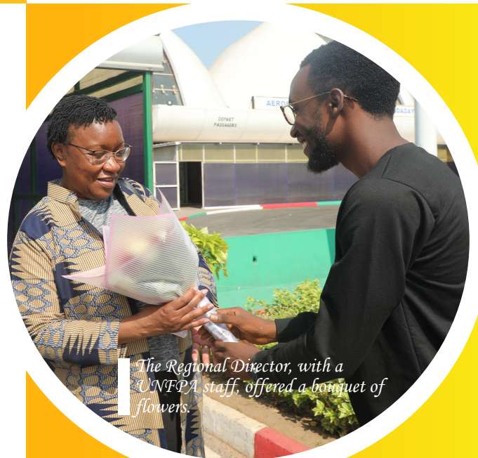
The Regional Director, with a UNFPA staff, offered a bouquet of flowers.

This annual event, which was themed " Investing in Early Childhood to Build Strong Human Capital for Life " aimed to emphasize the critical importance of investing in children's development to ensure a sustainable future. The visit also included a focus on the country office's activities, both in and outside of Bujumbura.