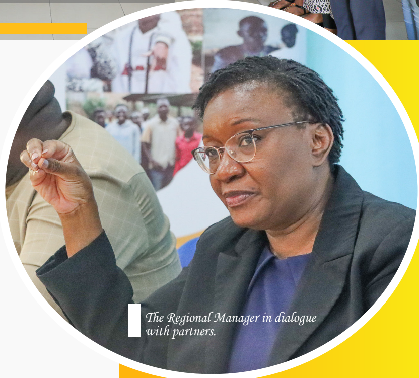
The Regional Manager in dialogue with partners.

In addition, given the context of reduced funding, various solutions were discussed to mobilize additional resources, particularly domestic ones, to move forward toward our shared goals.