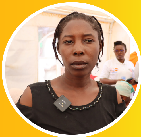
Testimony of a beneficiary