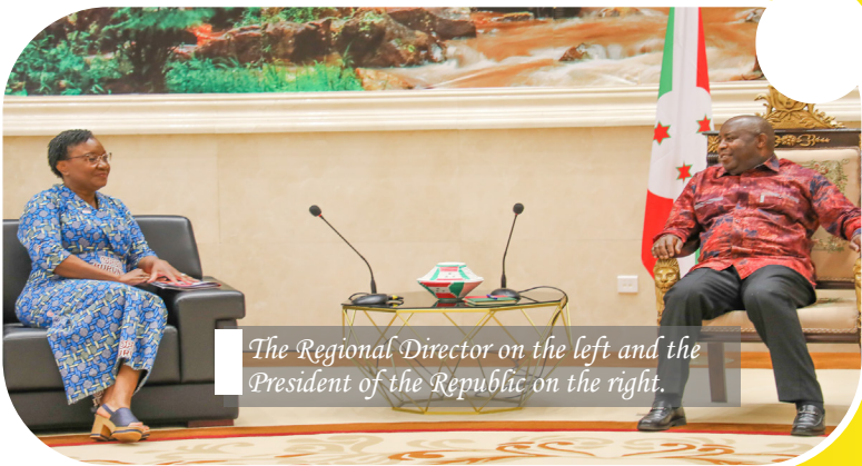
The Regional Director on the left and the President of the Republic on the right.

During the audience granted by the President of the Republic of Burundi to the UNFPA Regional Director, a fruitful exchange took place regarding the vision for an emerging Burundi in 2040 and its full development by 2060. This was an opportunity to discuss the government's commitment to the national census, a crucial exercise for strategic planning and collaboration with development partners. UNFPA reaffirmed its determination to work closely with the government to ensure the empowerment of women and youth, which is essential to unlocking the country's economic and social potential. The Director expressed her willingness to actively advocate for resource mobilization to support the financing of the National Development Plan and the 2040-2060 Vision.