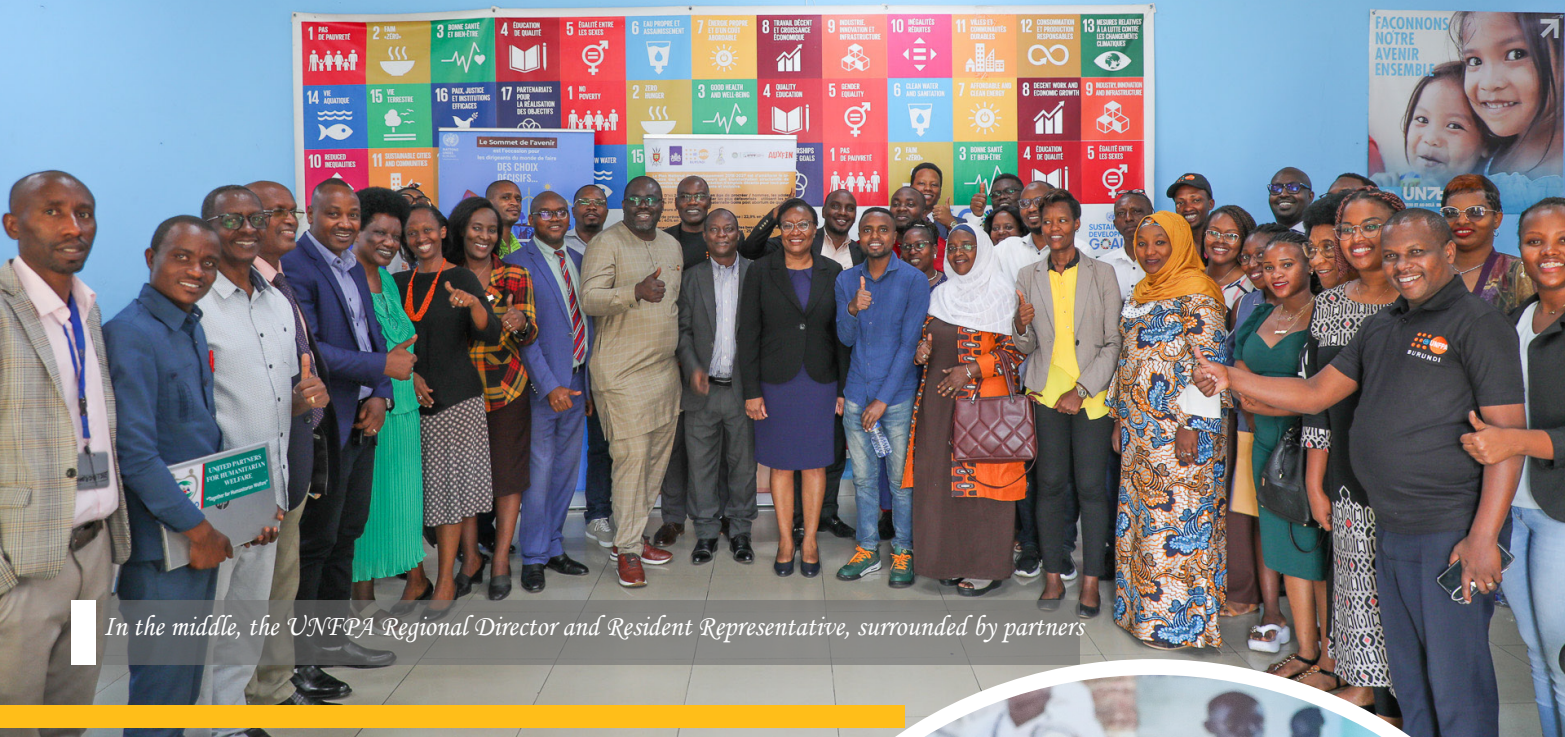
In the middle, the UNFPA Regional Director and Resident Representative, surrounded by partners