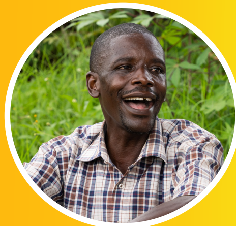
Testimony of a beneficiary

Testimonies from beneficiaries during the visit to ABUBEF and the displaced persons' camp in Mubimbi.