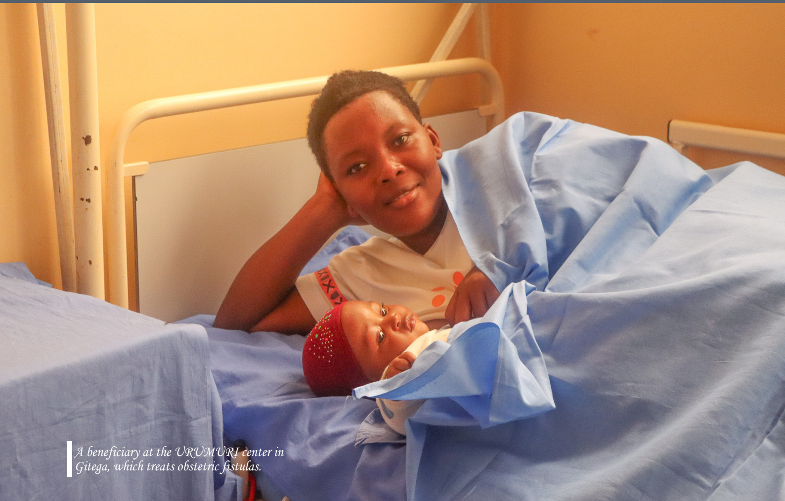
A beneficiary at the URUMURI center in Gitega, which treats obstetric fistulas.

Testimonies from beneficiaries during the visit to ABUBEF and the displaced persons' camp in Mubimbi.